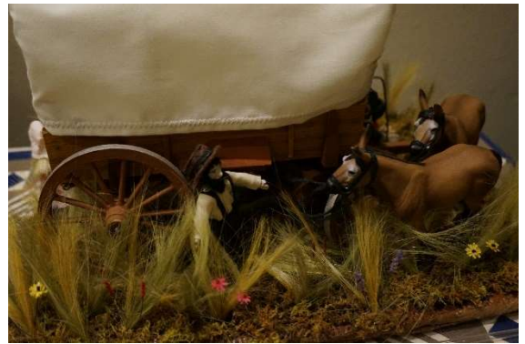
Little House on the Prairie Scene

Who will be next to sight a UFO – could it be you? If so, send pictures of your UFO sightings to zondagmd@hotmail.com .